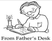
From Father's Desk